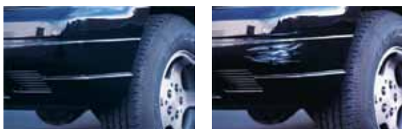
Blending a scuffed bumper can take less than 1 hour to repair.

But now, those small repair jobs can mean profit for your business. The Ding King SMART Paint Repair System allows you to offer fast, dependable repairs at a reasonable cost. Our innovative