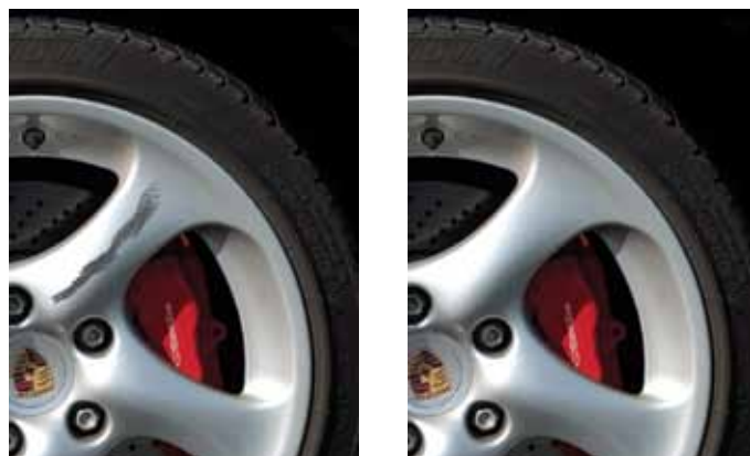
Our repair system will allow you to repair a variety of damage.

Customers are absolutely "blown away" when they learn that their wheels can be brought back to "like-new" condition. The benefits associated with the business are tremendous! Not only will your customers appreciate the cost savings over wheel replacement, they'll love the enhanced appearance it will provide to their car.