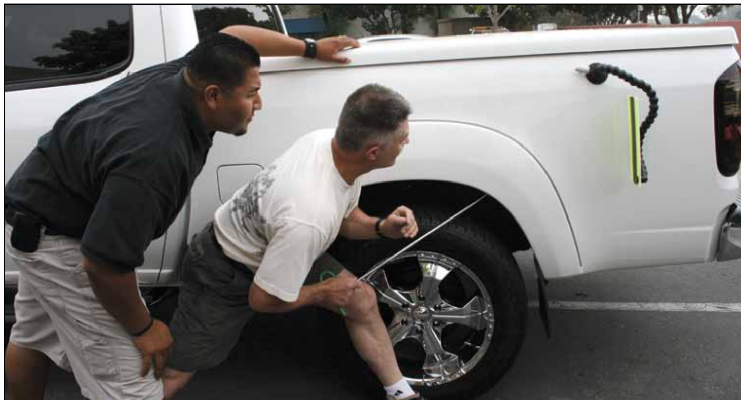
Over the shoulder, hands-on training on a variety of vehicles.