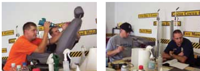
Hands-on supervised training.