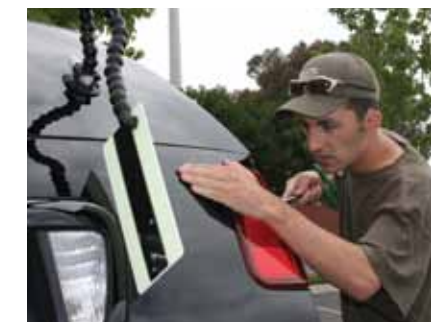
Technician using Dent Board while removing a dent.