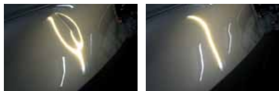
Large creased dent and repaired area after 40 minutes of repair time.

The Ding King approach to training paintless dent repair is hands-on and utilizes "proprietary processes." Whether a student prefers learning by the Pressure and Release Process (PARP) or the Drag and Push Process (DAPP), Ding King instructors adapt to each student's comfort. The Ding King utilizes proprietary methods for accessing dents without having to drill. The NO-DRILLING process, exclusive to Ding King, offers a "leg-up" on your competition.