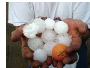
A handful of hail, and an orange golf ball.

Every year, all around the world, intense hail storms occur, leaving vehicles with quarter size to golf ball sized dents on all panels of the car. As a result, insurance companies worldwide have determined that Paintless Dent Repair is not only a "Viable Alternative" to traditional auto body repair; it is the "Preferred Method" of repair.