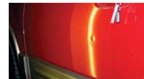
Double dent half way removed