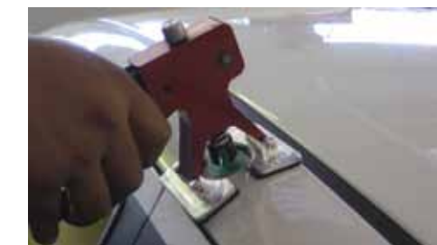
Dent Glue Puller in action.