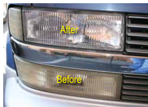
Repairs are completed in less than 15 min.