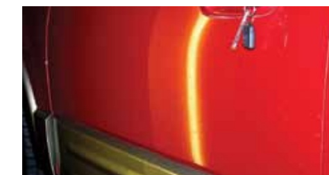
Repaired area after 15 minutes