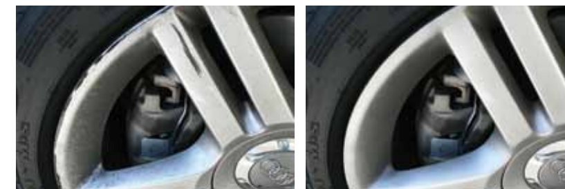
Another example of curb rash after 20 minutes of repair time.

Learn hands-on techniques for refinishing and customizing all types of wheels. Custom colors are becoming a great source of business.