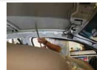
Learn to drop headliners to access hail damage.

The Ding King will teach you all the details associated with becoming a Hail Repair Specialist. We've trained hundreds of technicians who have gone on to become highly skilled professionals working at all levels of the industry. At The Ding King, you'll learn everything required to become a quality PDR technician.