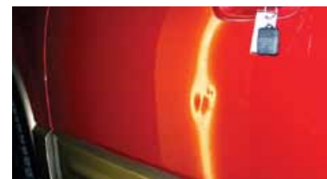
Double dent before