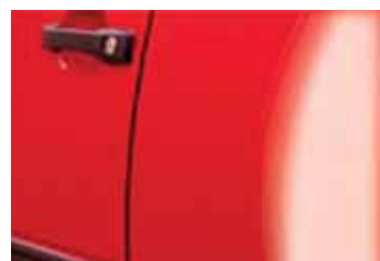
Typical door ding and repaired area after 10 minutes of repair time.

The next time you're in a parking lot, look around and notice all of the different types of damage that cars attract. Millions of cars and trucks have some form of minor cosmetic damage: scuffed bumpers, paint chips, dings, dents or hail, windshield damage, a cracked dashboard, curb damaged wheels or a car in need of a professional detail—Ding King can help you to repair them all.