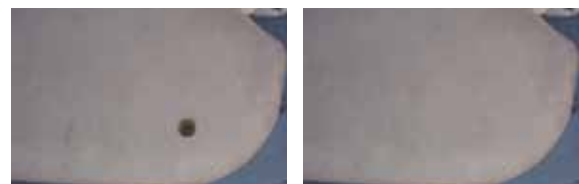
Cigarette burns before and after 15 minutes of work.